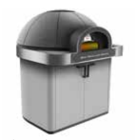
DOME + STAND