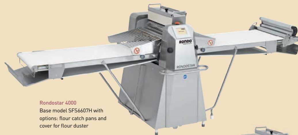
Rondostar 4000 Base model SFS6607H with options: flour catch pans and cover for flour duster

difficult dough types, for example, shortcrust pastry. Alongside its versatility, it features a modern control system, heavy duty build and hygienic design.