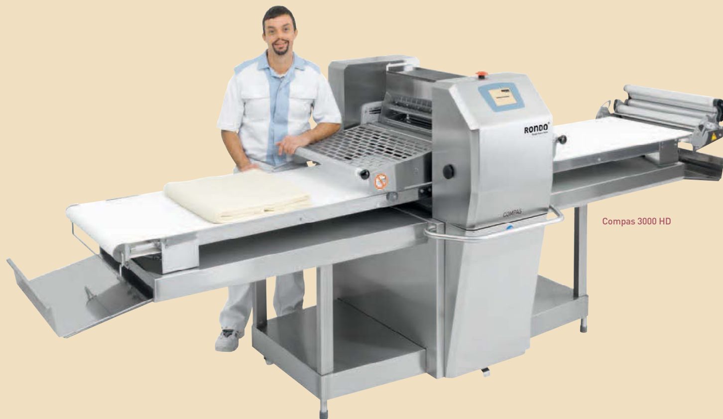
Compas 3000 HD

There is a very good reason why the name of the Compas is followed by the abbreviation HD for «heavy duty». The machine features particularly high performance and is built for continuous use. Its record-breaking operating speed will also impress you. It is also extremely robust, very easy to operate and processes all types of dough gently and reliably into consistent dough bands and blocks.