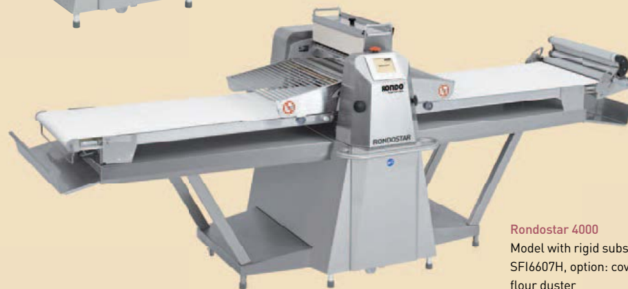
Rondostar 4000 Model with rigid substructure SFI6607H, option: cover for flour duster