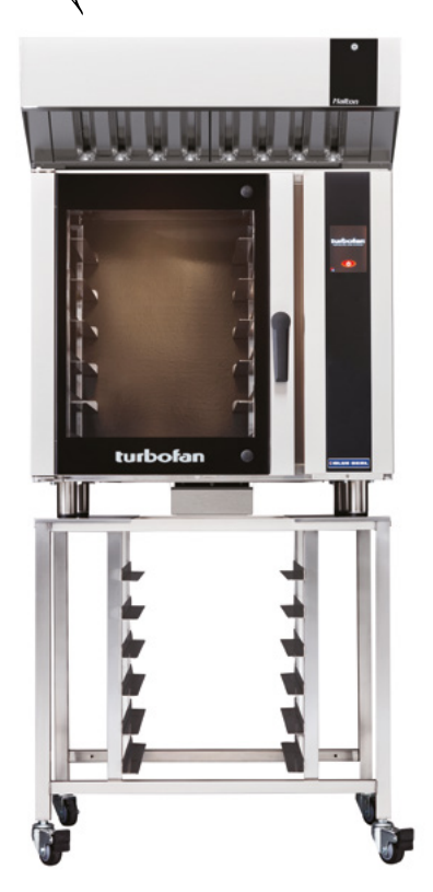
VH35-26 / E35T6-26 / SK35

Dimension 361/8"/918mm x 41"/1144mm x 143/4"/364mm Compatible with E35D6 / E35T6 convection ovens