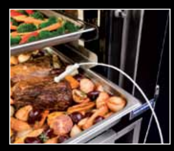
Core temperature probe.

Find the future with the USB-compatible touch screen model – the perfect high-tech solution for menu consistency. With uploading and downloading of product menu programs, you can easily keep multiple units up to date with menu changes.